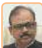
Tariq Anwar Former Union Minister of State, Ministry of Agriculture