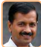
Arvind Kejriwal Chief Minister, Delhi