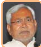
Nitish Kumar Chief Minister, Bihar