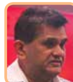
Amitabh Kant Secretary, Department of Industrial Policy & Promotion