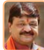
Shri Kailash Vijayvargiya Hon'ble Minister, Urban Administration, Housing & Environment, Govt of Madhya Pradesh