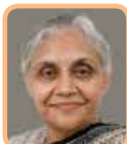
Shiela Dixit Former Chief Minister, Delhi