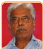
BS Bassi Commissioner of Police, Delhi