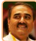
Praful Patel Former Union for Minister Heavy industries and public enterprises