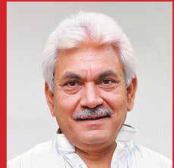
SHRI MANOJ SINHA HON'BLE MINISTER OF STATE, RAILWAYS GOVERNMENT OF INDIA