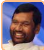
Ramvilas Paswan Minister of Consumer Affairs, Food and Public Distribution Government of India