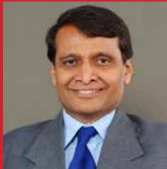
SHRI SURESH PRABHAKAR PRABHU HON'BLE UNION MINISTER, MINISTRY OF RAILWAYS, GOVERNMENT OF INDIA