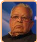
Kalraj Mishra Union Minister for MSME